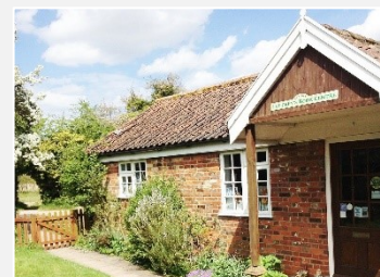
Norfolk Children's Book Centre Alby, NR11 7HB