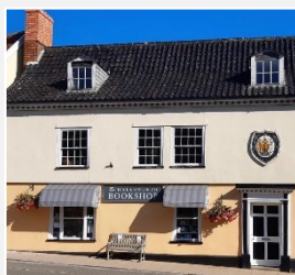
Halesworth Bookshop Halesworth, IP19 8AR