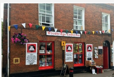
Woodbridge Emporium Woodbridge, IP12 1AL